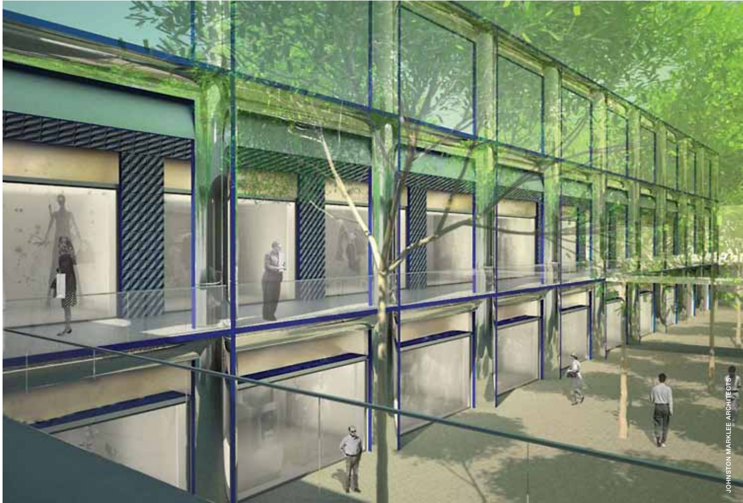
JOHNSTON MARKLEE ARCHITECTS