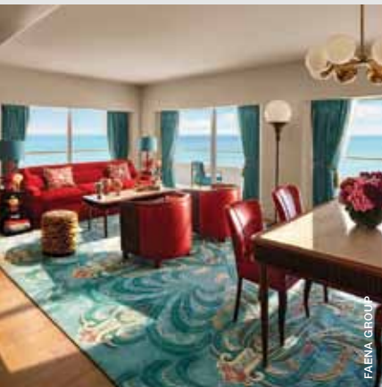
Oceanfront Corner Suite