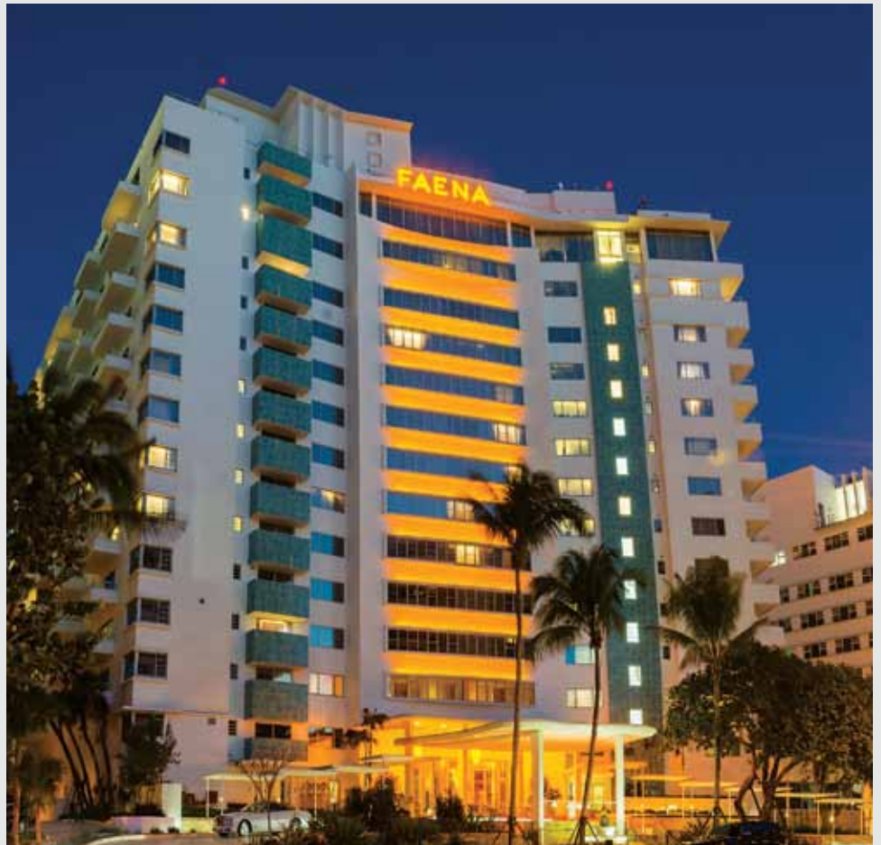
Faena Hotel, Miami Beach